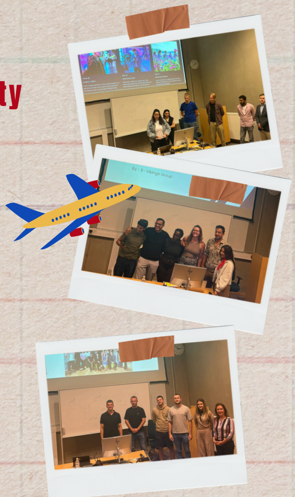
E-gov4youth participants at Tallinn, Estonia

Participants had the opportunity to design and present a project that could lead to social impact into their countries, as well visited several stakeholders in the digital governance ecosystem in Estonia.